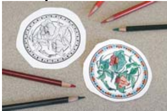
1. Colour your design with colour Pencils