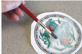
2. Paint on Liquid Sculpey and bake