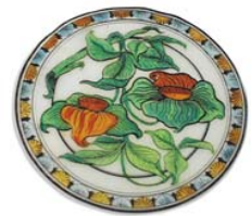
4. Design has permanently transferred onto Liquid Sculpey! Use the flexible image to decorate clay items, or windows or for decoupage!