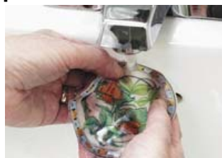
3. After baking, wash off paper